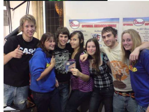
Below: The Steels at the DEN (with random local females)