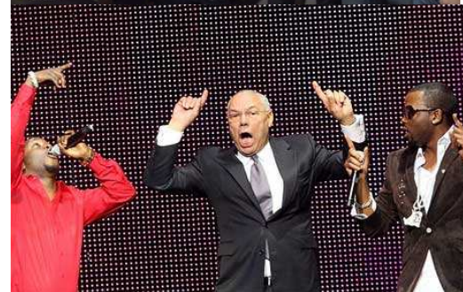
Above: Former US Secretary of State, Colin Powell plus African band – not at the DEN

THE DEN: About 2 weeks before half term the DEN was on. The DEN is a place where people get the opportunity to see their fav bands play or see new bands play. This month we had two great bands play. The first band to play were This Band Called ... they were really great bearing in mind they only knew the day before they going to be playing!!! WELL DONE GUYS!!! After they played everyone got a break from mad dancing!!! Most people gathered in the tuck shop room for a chat, game of pool and a well deserved drink and some sweeties!!!!