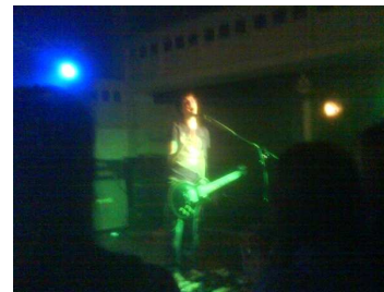
Left: This Band Called at the DEN